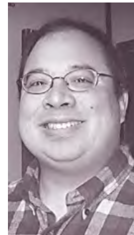
Phil Custodio write the author